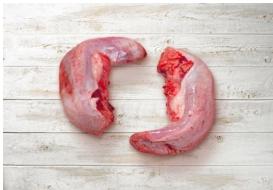
Pork tongue, frozen Pork tongue, Swiss cut. Product code: FI 2007, SE 303202