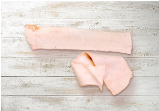
Pork back fat Pork back fat, rindless. Product code: FI 2932