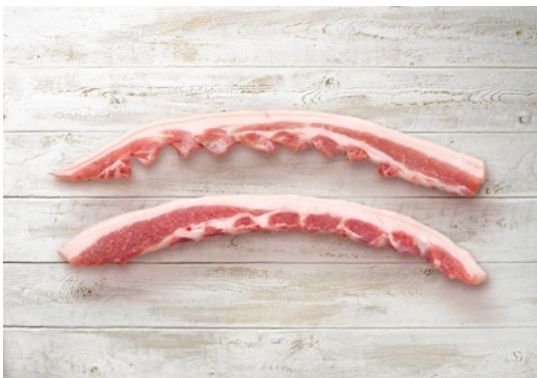
Pork belly strips Pork belly strips, rindless. Approx. 50% C.L. Product code: FI 3572, SE 505002

For specification, please contact our sales team .