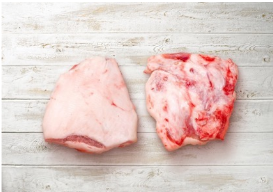
Pork jowl Pork jowl , rindless Product code: FI 2936