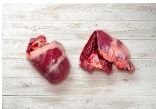
Pork heart, frozen Product code: FI 2015, SE 300883