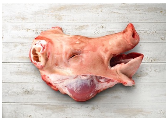
Pork head Pork head without earflap and jowl. Product code: FI 9899

For specification, please contact our sales team .