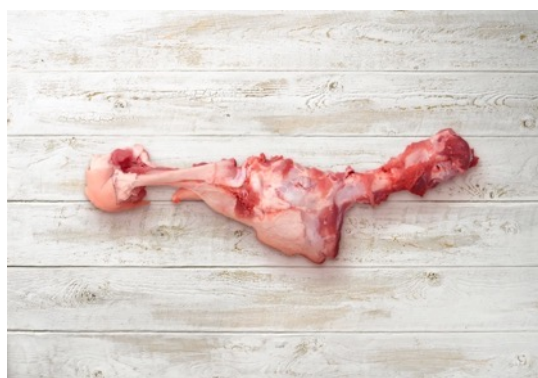
Pork femur bone 2-joint Product code: FI 9258